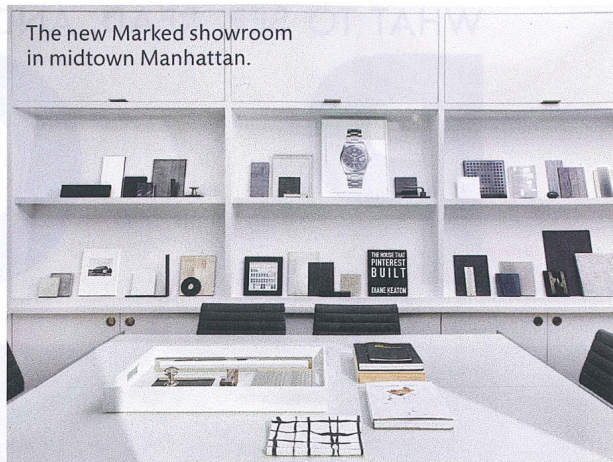
The new Marked showroom in midtown Manhattan.